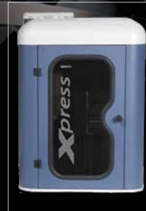
Optional Locking Security Cover