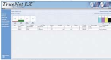
Windows XP & Vista (32 & 64bit)