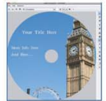
Built-In Label Designer